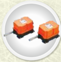
ROTARY LIMIT SWITCH