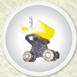
SQUARE TUBE TROLLEY